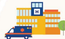
Risk and quality